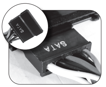
S-ATA HDD Connector Head