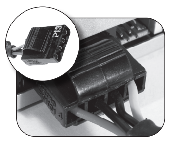
4-Pin Peripheral Connector