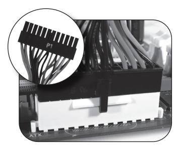
24-Pin Main Power Connector Head