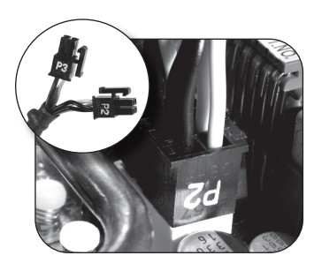
4+4-Pin ATX/EPS CPU Power Connector Head