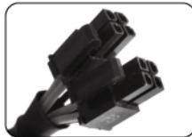
CPU connector (4+4 Pin)