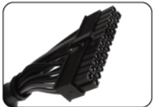
ATX Motherboard connector (24 Pin)