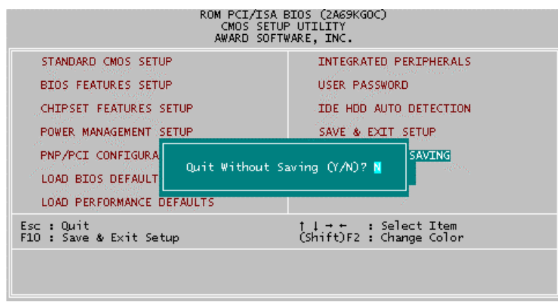
Figure 4.13: Exit Without Saving

Type "Y" will quit the Setup Utility without saving to RTC CMOS SRAM.