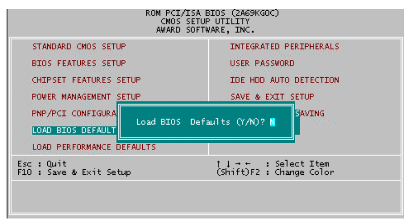
Figure 4.7: Load Bios Defaults