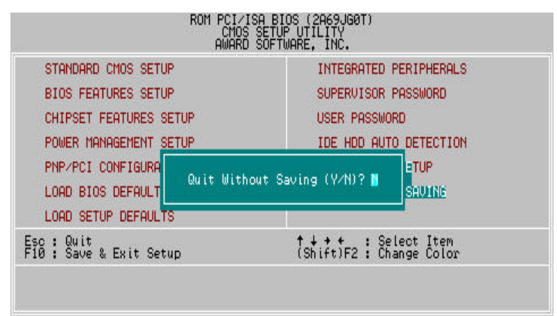
Figure 4.13: Exit Without Saving

Type "Y" will quit the Setup Utility without saving to RTC CMOS SRAM.