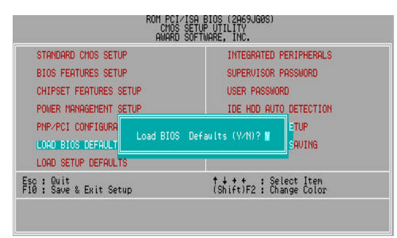
Figure 4.7: Load BIOS Defaults