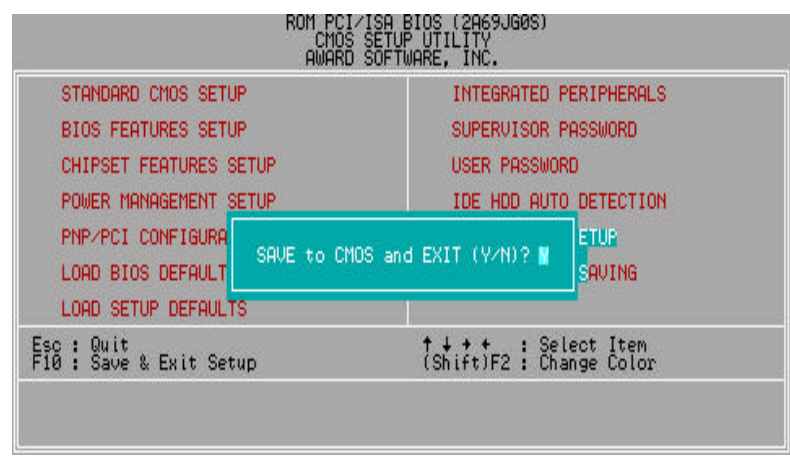
Figure 4.12: Save & Exit Setup

Type "Y" will quit the Setup Utility and save the user setup value to RTC CMOS SRAM.