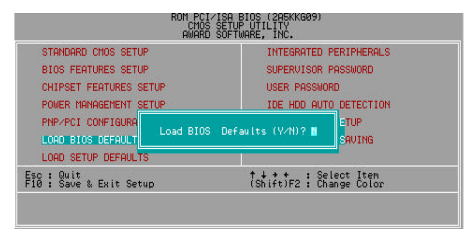
Figure 4.7: Load BIOS Defaults