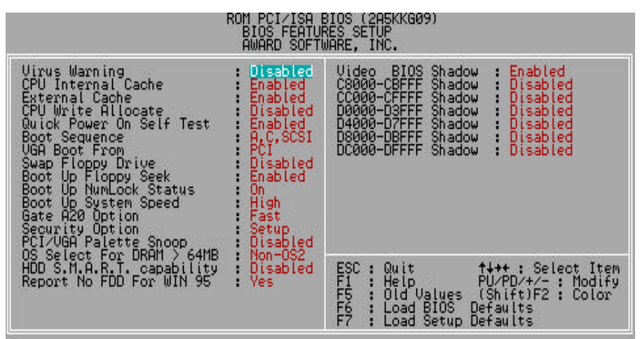
Figure 4.3: BIOS Features Setup