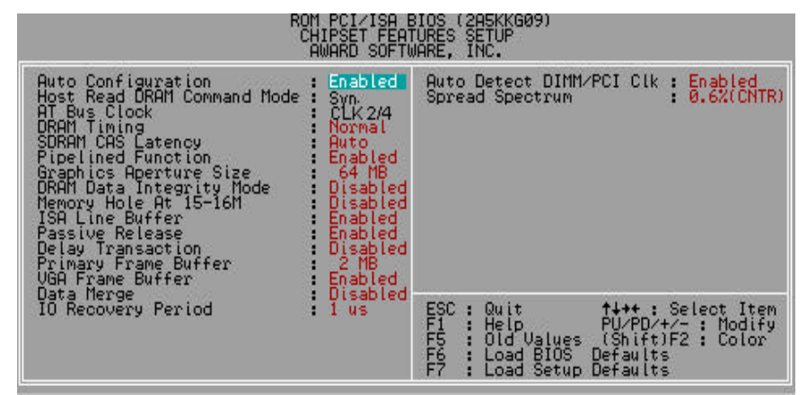
Figure 4.4: Chipset Features Setup