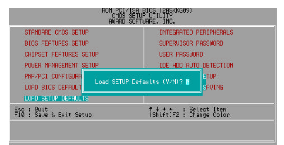
Figure 4.8: Load Setup Defaults