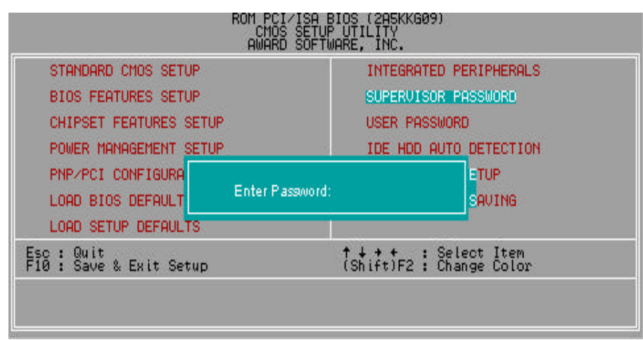
Figure 4.10: Password Setting

When you select this function, the following message will appear at the center of the screen to assist you in creating a password.